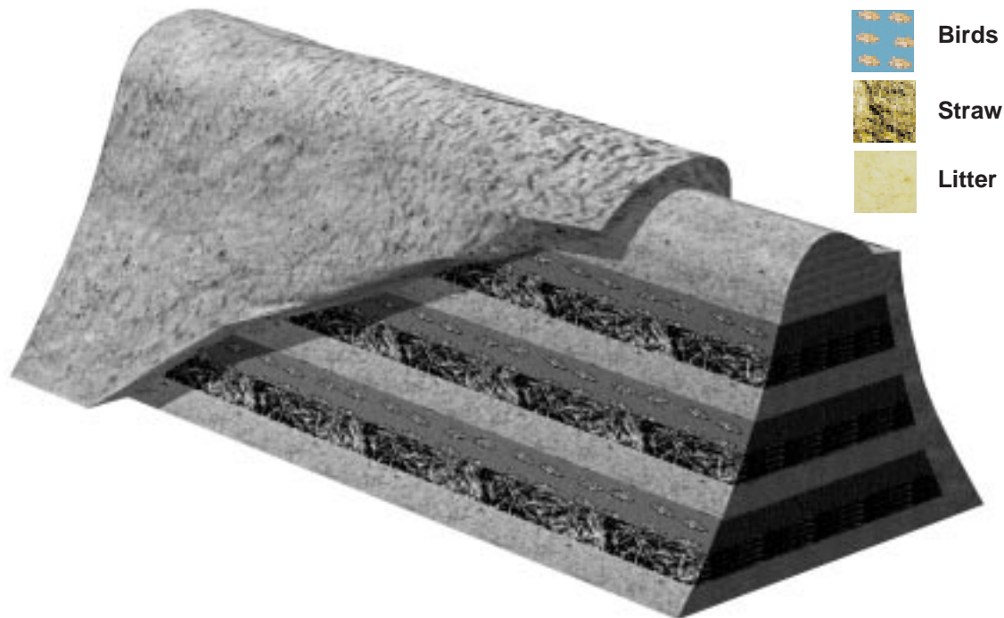
Figure 7. Catastrophic mortality windrow.

required for egg laying. Other insects normally found in decaying woody products may be present in the compost during the process and should not be considered pests.