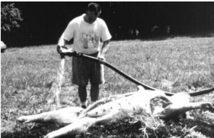
Figure 6. Preparing a large carcass for compost.

Composting carcasses is a good biosecurity measure because most pathogenic organisms common to animal production can be killed by exposure to thermophilic temperatures (135 to 155 °F) in a compost pile or bin. However, some pathogenic organisms such as BSE (mad cow disease) and scrapies in sheep may not be controlled at compost process temperature. Farmers with known cases of these temperature-resistant disease organisms should seek the advice of their veterinarian.