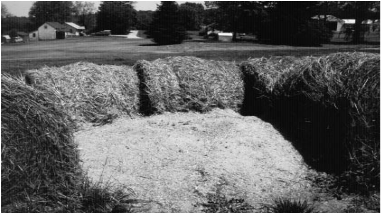
Figure 4. Temporary bale bin composter.

In this process the control of pathogens is maximized when the entire mass reaches temperatures greater than 130 °F for at least 3 days. The combination of the cooking process, rapid degradation, and compost cover provides control of odor and flies, but large bones may still remain. As with minicomposters, a thermometer is necessary for management of the two-bin system.