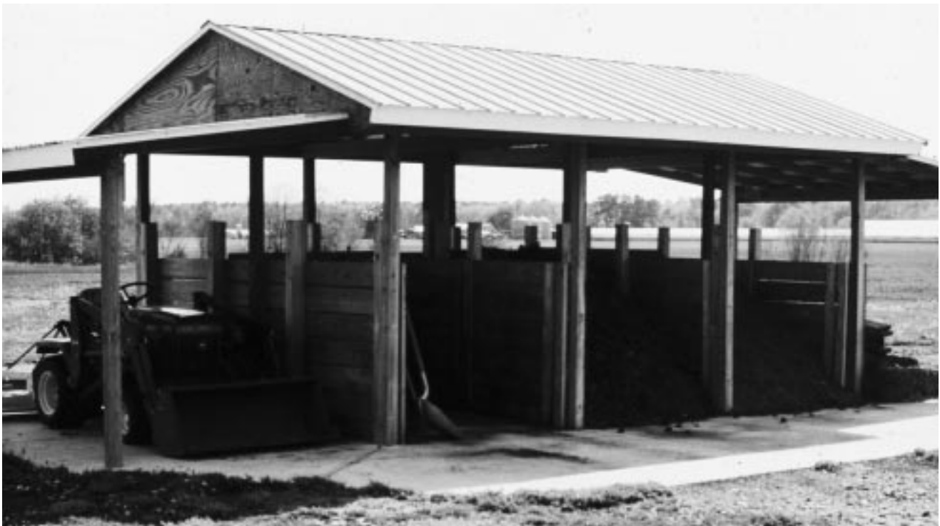
Figure 3. Freestanding composters.

Ideally, bins should be constructed of treated lumber or concrete on an impervious surface and covered by a roof (Figure 3). The impervious floor allows use in all weather conditions and assists in identifying the production of leachate from saturated compost. Roofing allows improved compost moisture control in both wet and dry weather. Many states provide cost sharing for the construction of permanent bins. Approved designs and operational practices are available from