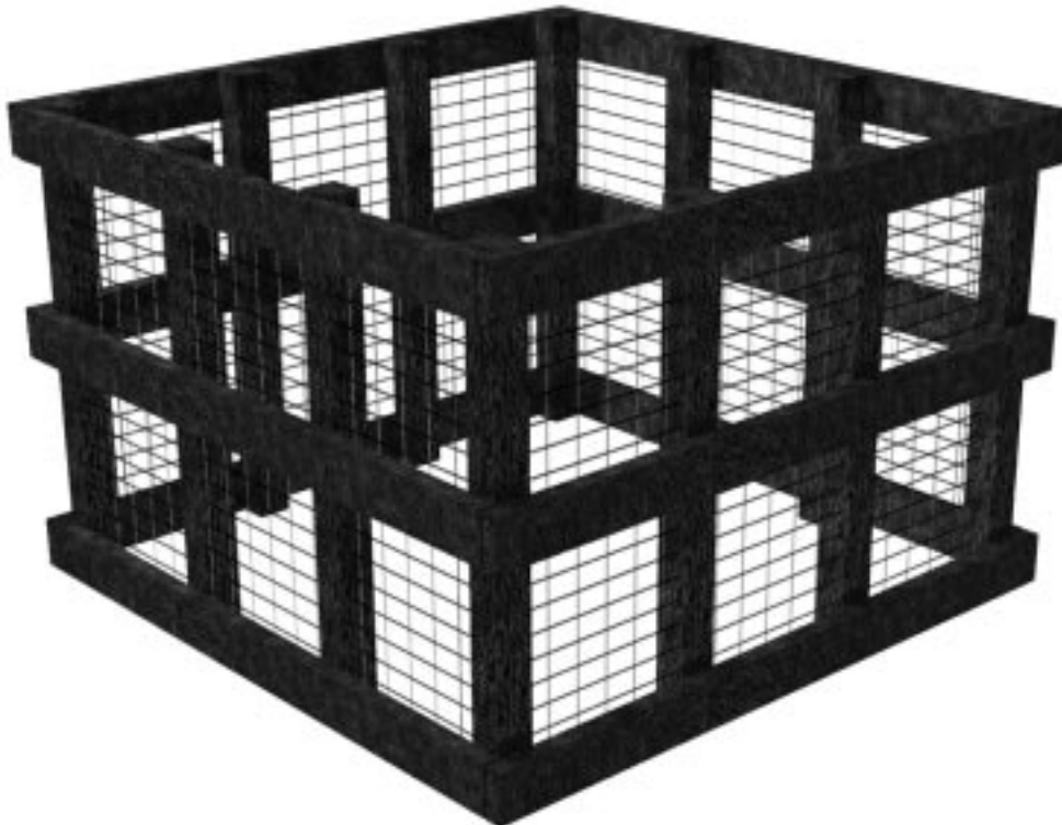
Figure 1. Minicomposter.

The bin is started by layering compost ingredients in the minicomposter. A proven volumetric