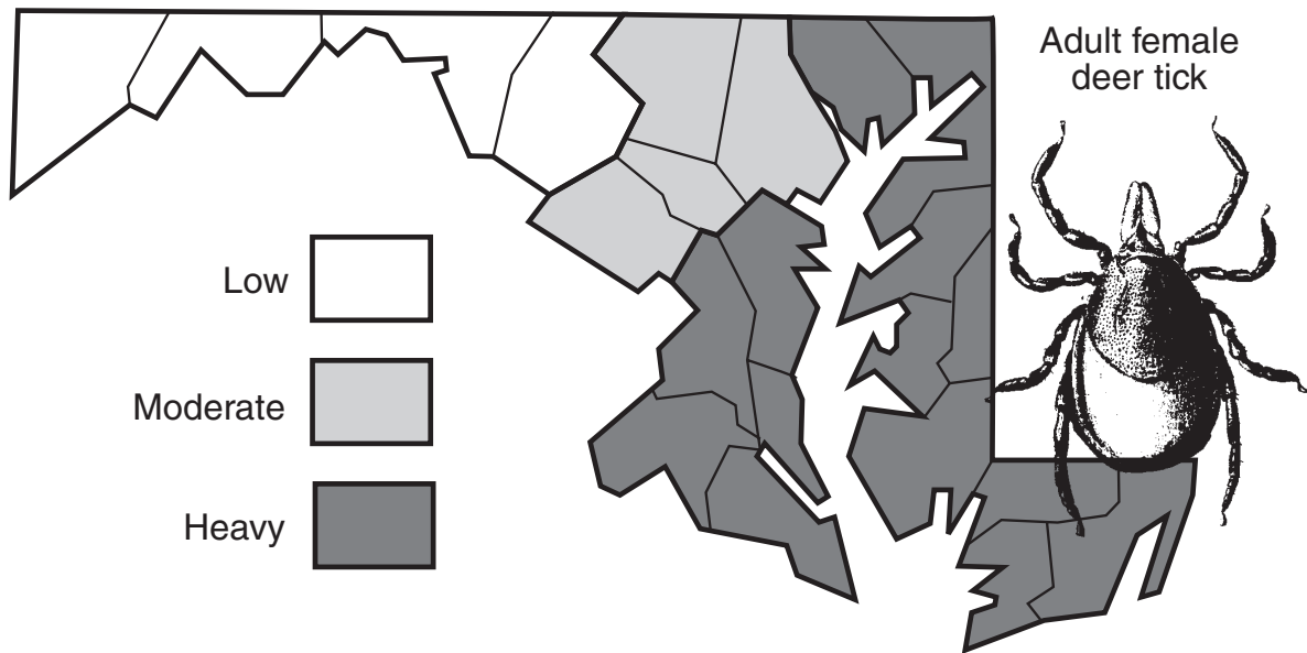
Figure 3. Distribution of deer ticks based on the number of ticks found on examined deer.