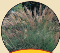
Miscanthus Yaku Jima