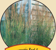
Calamagrostis Karl foerster