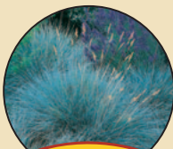
Festuca Elijah Blue