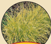
Carex Gold Fountains