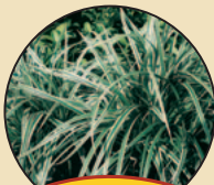
Carex Silver Sceptre