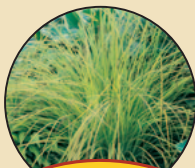
Carex Bowles' Golden Sedge