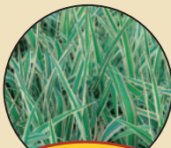
Phalaris Strawberries and Cream