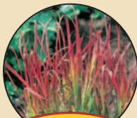
Imperata Red Baron