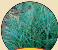
Carex Ice Dance